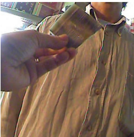
Undercover camera showing sale of rhino horn in Hanoi 2011

Clearly, Vietnam's failure to enforce its CITES implementing legislation and prosecute individuals involved in the illegal rhino horn trade is diminishing the effectiveness of CITES.